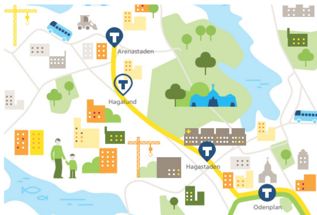
Figure 1. Expansion plan of Stockholm's Tunnelbana metro system from Odenplan to Arenastaden, "Yellow Line"

Amberg Engineering, as one of the underground engineering consulting companies of the Tunnelbana Odenplan to Arenastaden project, was tasked with finding engineering solutions for challenging areas in the subway tunnels & modeling and coordinating the tunnels through the use of BIM.