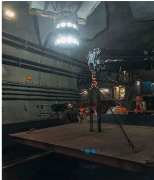
Figure 3. MCIS before entering the shaft B.

The data acquisition for inspecting the shaft B occurred on the 11 th and 12 th of July 2021, around midnight when a free slot in the train traffic schedule was available. In coordination with Amberg, the SBB provided a special crane with over 800 m of rope and a case for the MCIS installation. Before the measurement, everything was installed and tested on-site. Just before entering the shaft from its top, the MCIS with all its subsystems was initiated, and autonomous data recording commenced.