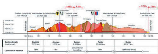
Figure 2. Geological profile of the Gotthard Base Tunnel, with localisation of the Sedrun Shaft.

In the original concept of Sedrun section, shaft B was not included. The decision for building a second shaft was taken at a later project stage for reasons of construction operations, ventilation, and safety. During the ongoing railway operating phase, shaft B serves as an exhaust air shaft for ventilation in normal operation and in case of an incident. Since this function is crucial for operational safety, the structure must be included in the inspection and maintenance planning for the Gotthard Base Tunnel.